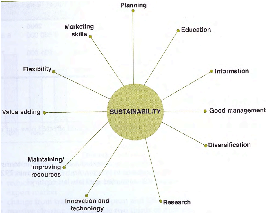
Figure 2: Concept Diagram of Sustainability (Clark, 2003).

The HSC syllabus was amended in 2009 following concerns about differing workload and practices from other HSC courses, overlap between components, lack of clarity between the Preliminary and HSC content, and the inability of the syllabus to support multiple choice questions in the HSC exam (Randall, 2009). Whilst both the 1999 and 2009 syllabi aim to develop in students the responsible attitudes and skills needed to manage and market agricultural production in a sustainable manner (Board of Studies NSW, 1999a, Board of Studies NSW, 2009a) there is no attempt to provide a definition of sustainable agriculture per se. The textbook written for this syllabus also does not provide a clear definition, however, it expands upon the production-based definition used in Year 7 to 10 to highlight the need to consider wider implications and include stakeholders beyond the farm gate in addressing sustainability (Clark, 2003). This expanded definition is represented in Figure 2.